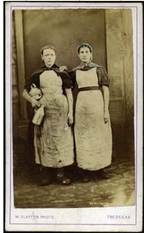
Photo of 2 Young Employees at Brown's Island (Not identified, Not dated)